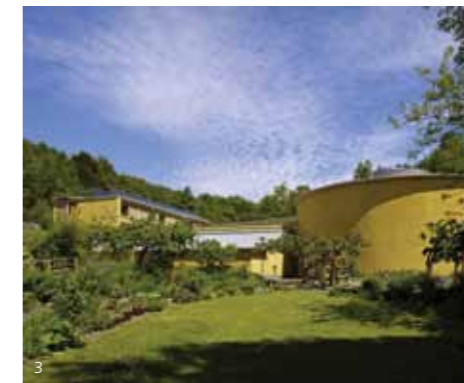
Front, 1, 2 and 3 WISE Building, Machynlleth (photographs: Tim Soar) 4 Elm Grove housing, Dinas Powys (drawing: courtesy of Graham Brooks) 5 and 6 Artificial sky and wind tunnel (photographs: CRiBE, Welsh School of Architecture) 7 Graffeg book covers (montage: Graffeg)